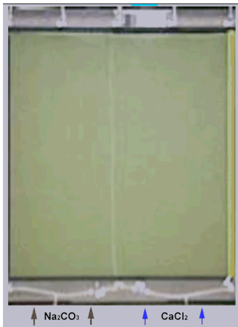
Figure 1. Mesoscale experimental flow cell (60 cm by 60 cm). The flow cell is filled with 0.5 mm quartz sand and is relatively thin in the third dimension. Two solutes are injected along two halves of the lower boundary as indicated by the red and blue arrows. The reaction causes precipitation of calcium carbonate minerals (the white zone approximately 0.5 cm wide in the center of the flow cell).

The experiment shown in Figure 1 provides a relevant example of such a system. In this experiment, two solutes mix and react to precipitate calcium carbonate minerals (e.g., calcite) within a very narrow zone in the center of the experimental cell. We have performed pore-scale simulations of the mixing and reaction processes in this type of system [8] as shown in Figure 2. The simulation results indicate that 1) strong mixing of the two solutes is limited to a very local region (only a few grains wide), and 2) the mixing is inhibited by mineral precipitation leading to a strong negative feedback or coupling between the reaction and transport across the narrow mixing zone in which precipitation occurs. In this case, the precipitation/dissolution reaction described in detail by the pore scale model is not easily represented at the continuum scale, but it could be efficiently modeled by simulating the narrow mixing zone with the SPH model at the pore scale and simulating the remainder of the model domain with a computationally efficient continuum-scale model.